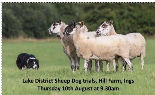
Lake District Sheep Dog trials, Hill Farm, Ings Thursday 10th August at 9.30am